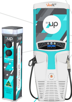
EV Charging Hardware

Innovative & inventive Australian-made AC and DC charging hardware & software